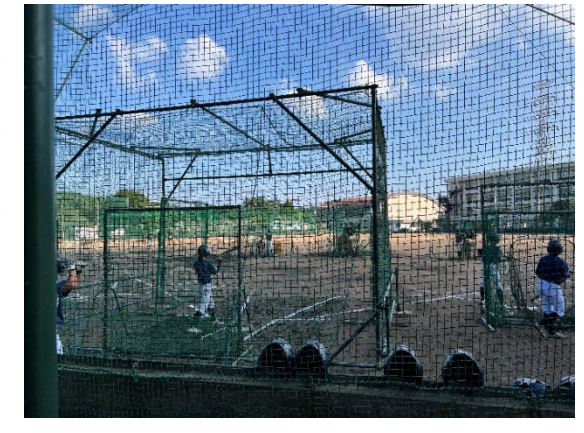
Figure 7 Kobe Koryo Girls Team Practice

We look forward to hosting the Kobe Koryo Gakuen girls' baseball teams in February 2025 and pursuing opportunities to bring NPB teams to Queensland for Spring Training. Further discussions with