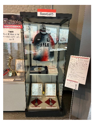
Figure 5 B5 Showcase in Japanese Baseball Hall of

During our stay in Tokyo, Mr. Nakamura kindly provided us with tickets to watch the Tokyo Giants face off against the Yakult Swallows at the Tokyo Dome. We also visited the Japanese Baseball Hall of Fame, where the inclusion of Baseball5 trophies showcased Japan's growing interest in this version of the game.